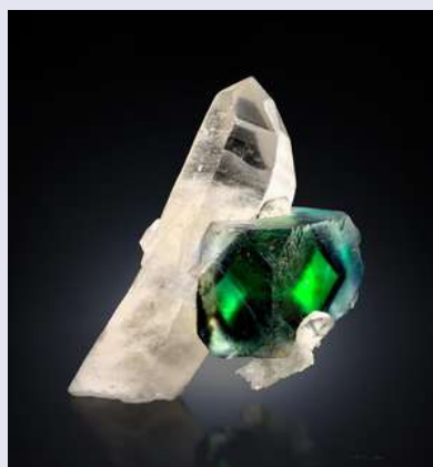
From Fabian Wildfang collection

This exhibition is more than just a presentation of minerals; it's an ode to a passion for mineralogy, enriched by the expertise of renowned museums and eminent collectors. It's an invitation to an educational adventure, where you'll discover why it's impossible to find an aquamarine near Paris, and why Cave-in-Rock fluorite is never associated with a granite gangue.