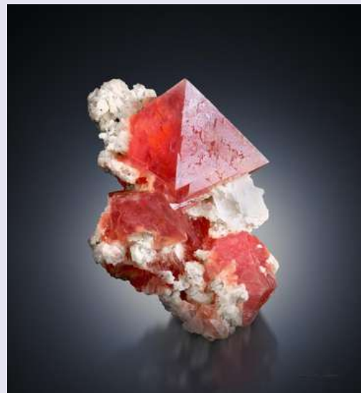
From Fabian Wildfang collection

You'll never admire minerals in the same way again.